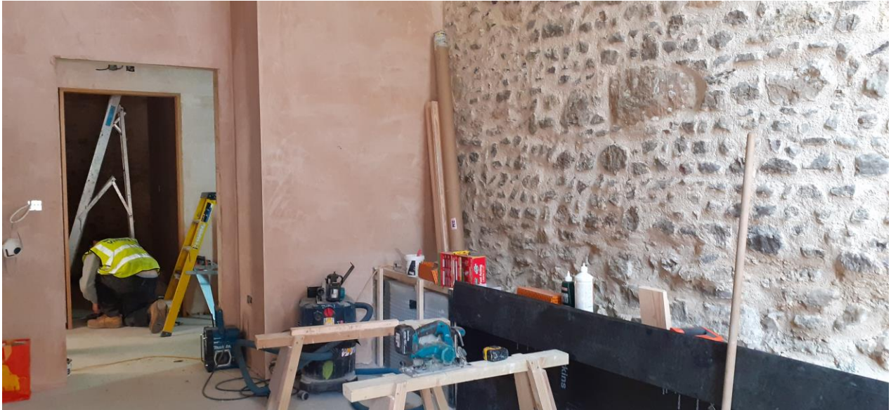
Inside the new extension: The beautiful stonework on the right, having been carefully repointed, will be left exposed.