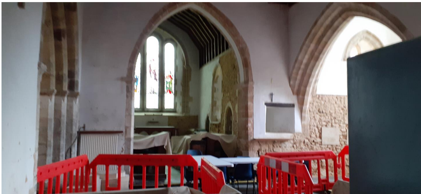
Inside the church, looking towards the chancel with the South Transept on the right.